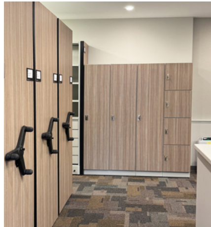
Day Use Lockers