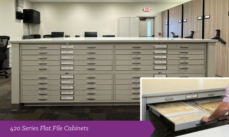
420 Series Flat File Cabinets