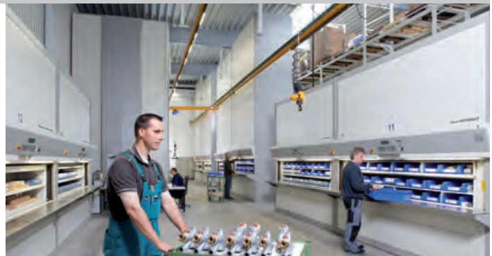
Buffer storage of parts and components needed in the production area