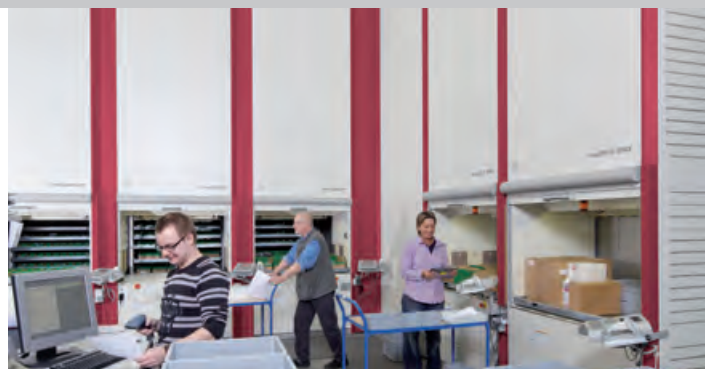
The combination of Hänel Lean-Lift® and Hänel Multi-Space® systems saves space in the shipping area