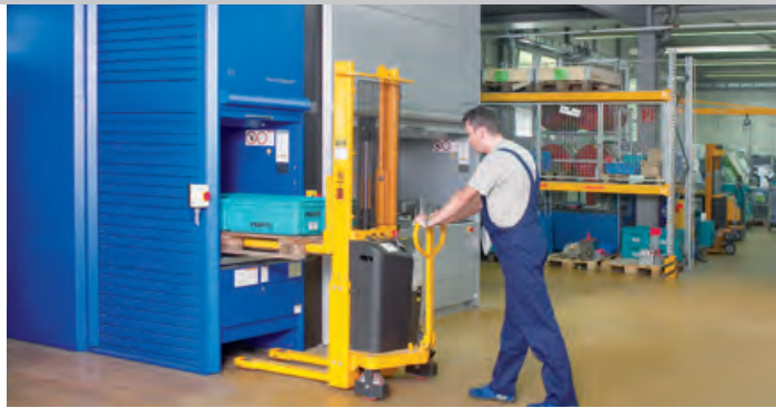
Integration in a modern building on two floor levels, with storage input supported by a Hänel Lean-Lift® pallet system on the ground floor