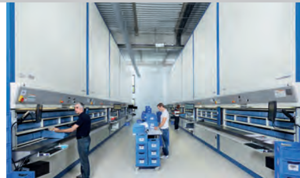
The Hänel Rotomat® storage carousel ensure that small parts are retrieved quickly and efficiently

The compact construction enables up to 60% more storage capacity to be created on a minimal footprint by making use of the available room height. No two Hänel Rotomats® are the same, because each task demands a precisely defined solution.