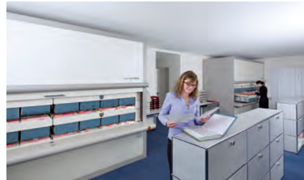
The attractive, modern design of the Hänel Rotomat® looks good in any office

All Rotomat® office carousels are also available in a version suitable for disabled operators.