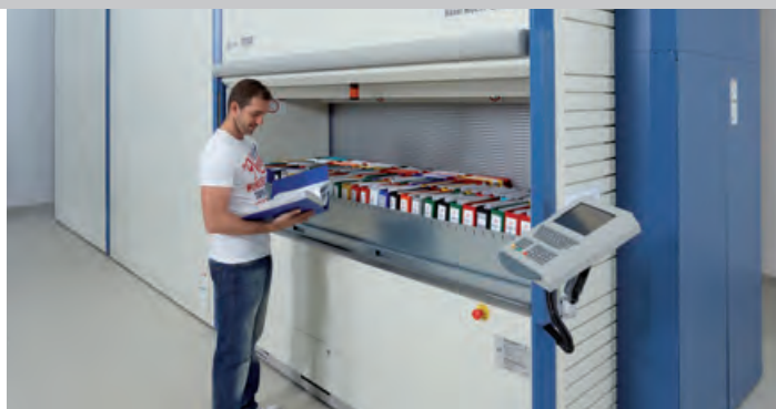
Safe and secure storage of parts, components and documentation in the Hänel Multi-Space® equipped with access management