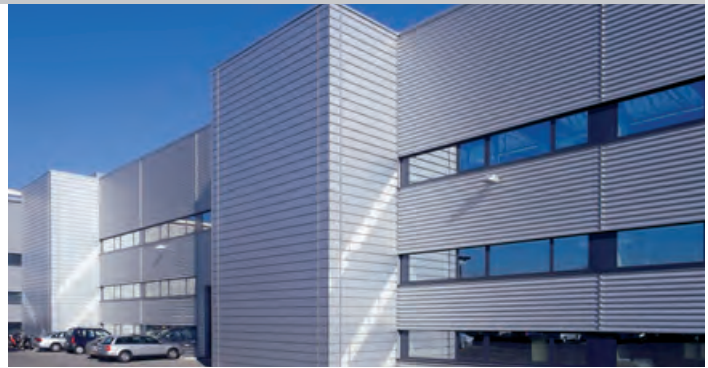
Two groups of Lean-Lifts® spanning multiple floors were attached to this building from the outside – no production space was sacrificed