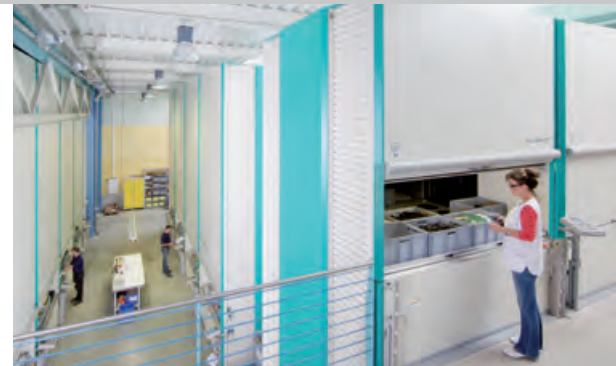
The access points of Hänel Lean-Lift® systems can be installed on different floors

The storage locations are accessed automatically under electronic control by means of the extractor, which stores or retrieves the requested container. The goods are then delivered to the retrieval area at the correct ergonomic height.