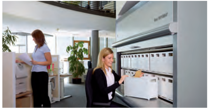
Intelligent management of card files with maximum capacity on a small footprint – right in the office