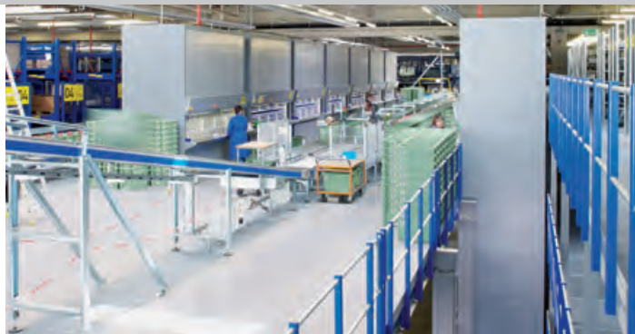
Optimal use of the available storage area on multiple floors