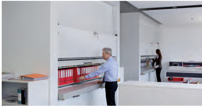
The Hänel Rotomat® with additional fire protection (optional). A fire-retardant door at the access point gives the files optimum fire protection