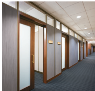
Glass transoms or clerestory windows add daylight in a space with solid fabric-wrapped walls and frosted glass doors.