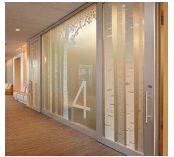
Custom graphics and field-applied film on glass provides endless opportunities for client personalization.