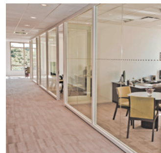
Achieve an elegant aesthetic with full-height butt-glazed glass panels.