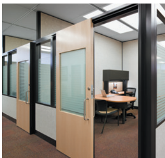
Alternate cornice-height walls with full-height walls to provide an open feeling and enhance visual interest.