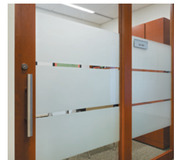
KI's Genius Architectural wall door options support wood, glass or a combination of substrates from basic to intricate custom designs.