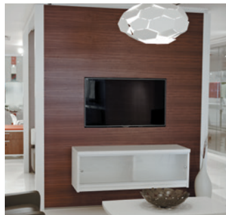
Seamlessly integrate power and data as well as hang-on components and accessories.