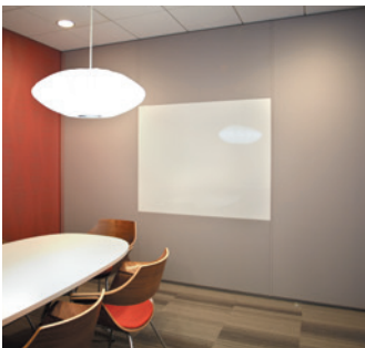
Alternate multiple panel substrates, such as magnetic markerboard painted steel recessed within full fabric shells.