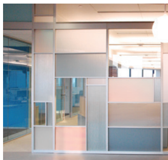
Unlimited options for custom designs such as multi-colored segmented glass give unique personality to a space.