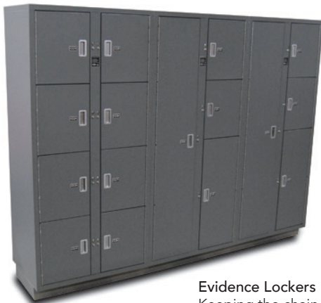
Evidence Lockers Keeping the chain of custody intact with non-pass-thru evidence lockers continues to be crucial when a case goes to trial.