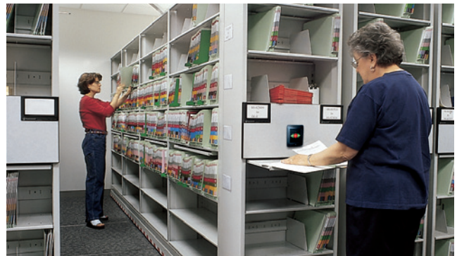
HDMS Systems Open, active case files – kept in StoreFront® sorter units on the ends of a Spacesaver HDMS System's carriages – can be located and pulled quickly and easily.