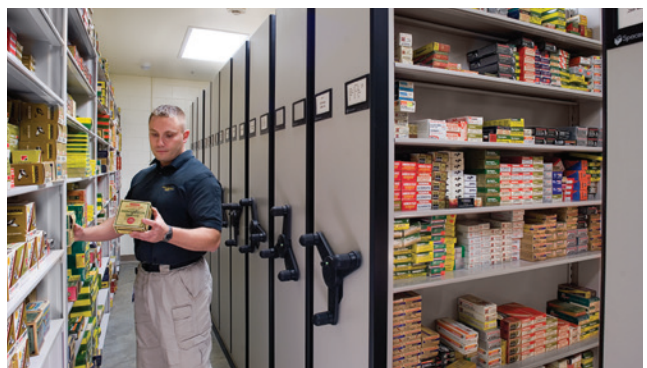
High-Density Mobile Storage (HDMS) Systems A mechanical-assist HDMS System stores virtually every kind of ammunition or lab supplies known. This unit features eight-inch-deep custom shelves, versus traditional shelf sizes, to conserve space.