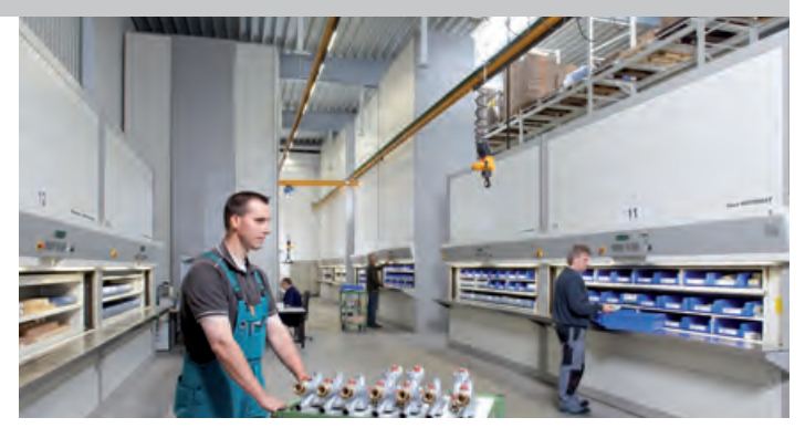
Buffer storage of parts and components needed in the production area