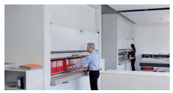
The Hänel Rotomat ^{\mbox{\tiny B}} with additional fire protection (optional). A fire-retardant door at the access point gives the files optimum fire protection