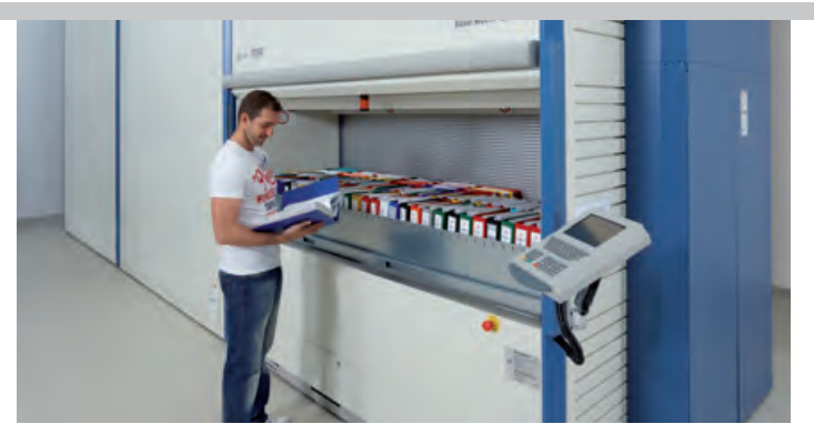
Safe and secure storage of parts, components and documentation in the Hänel Multi-Space ^{\rm \tiny (B)} equipped with access management