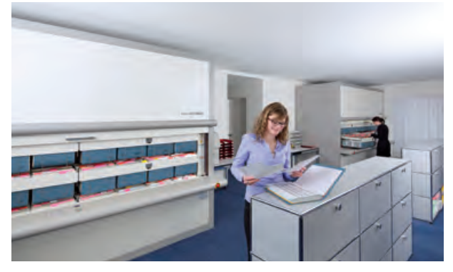
The attractive, modern design of the Hänel Rotomat<sup>®</sup> looks good in any office

All Rotomat<sup>®</sup> office carousels are also available in a version suitable for disabled operators.