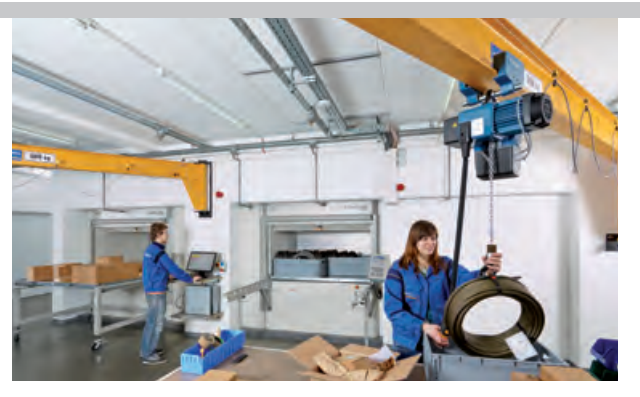
High throughput is achieved with two retrieval points that allow for simultaneous order picking

Even the number of retrieval points is variable and can be changed at any time.