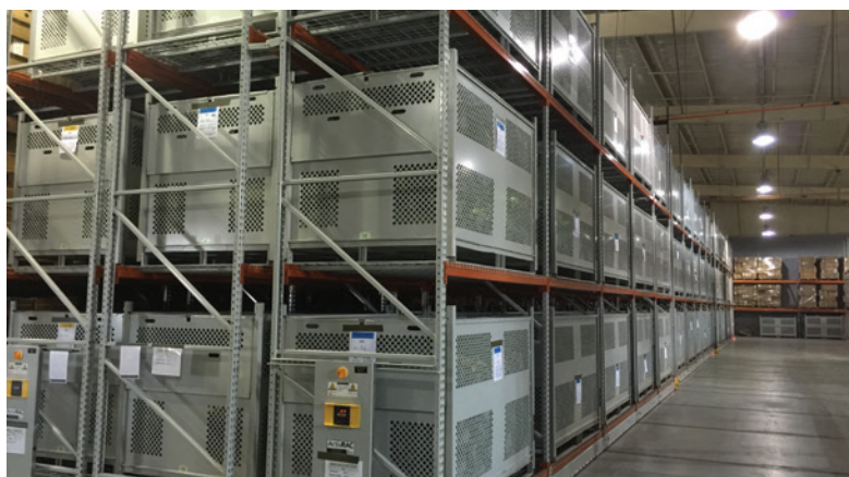
Parachute Container on ActivRAC® Mobilized Storage System