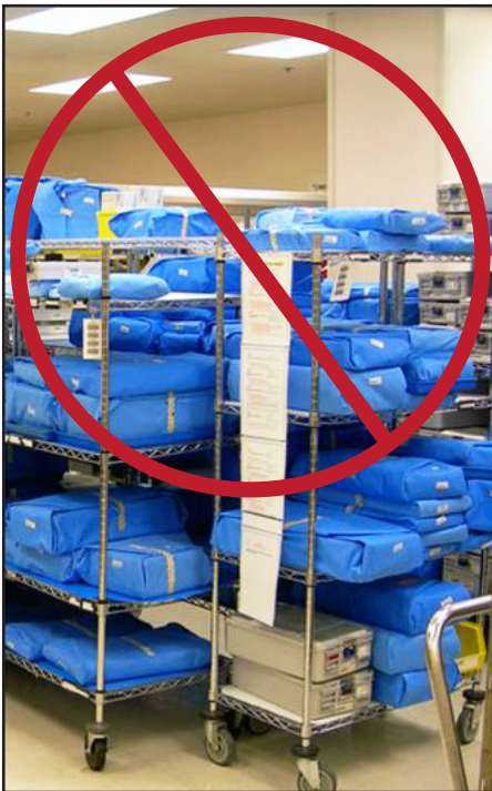
NO MORE SEARCHING!

Rotomat® Storage Carousels are fully enclosed, allowing storage floor to ceiling that is secure and protected. Automation and inventory management ensure that proper inventory levels are maintained and that items do not expire. Carousel shelves are customized to suit individual needs, avoiding stacking and ensuring ideal storage conditions.