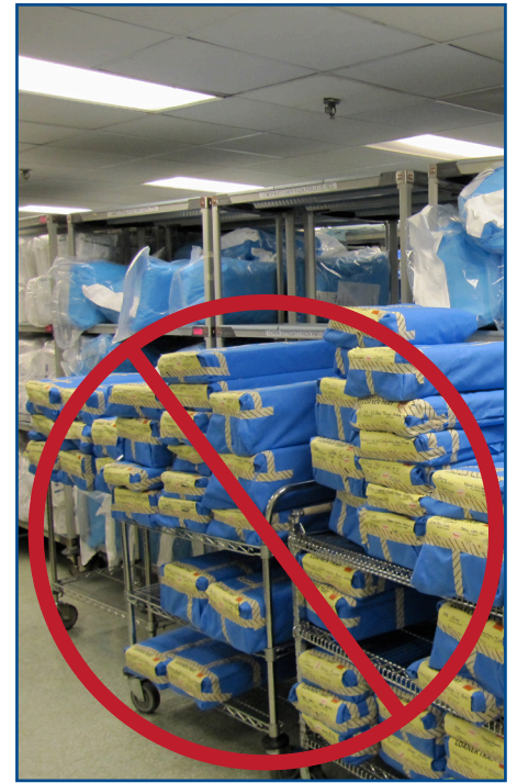
NO MORE STACKING!