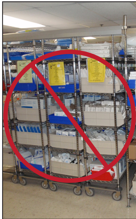
NO MORE CROWDING!