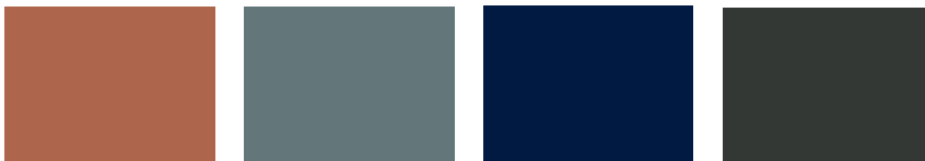
Red Iron RI (252)