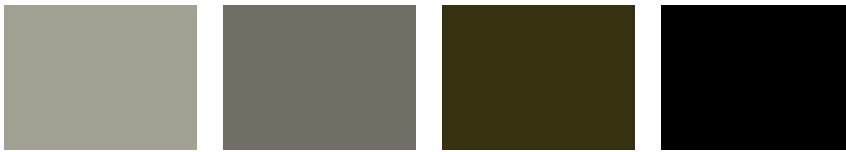
Designer Grey DG (2)