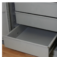
Internal Drawers 6 and 9 inch high drawers offer more custom space, and are available in locking or non-locking configurations.