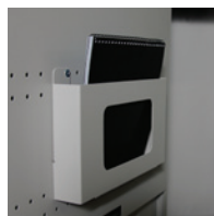
Document Holder Door-mounting allows easy access to documents and notebooks.