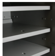
Adjustable Shelf Available in standard and heavy duty capacities for storing everything from clothing to ammunition.