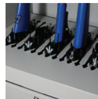
Universal Base Use in conjunction with the EZ Rail or support rail, and with Spacesaver weapons storage components.