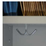
Hook Kits Add single hooks to the side of the modular shelf or a double-hook to the bottom for more hanging storage.