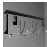
3-Hook Bracket Hook bracket can be moved up and down, and from one side of the locker to another.