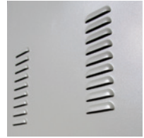
Louvered Doors and Drawers Louvers help direct optimal air circulation.