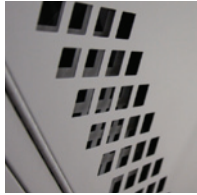
Visibility/Circulation Diamond perforated doors offer visibility as well as natural air circulation and ventilation.