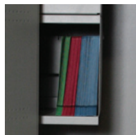
Modular Shelf Available in 12" and 24" heights. Add accessories like the file divider kit to further compartmentalize and customize the locker.