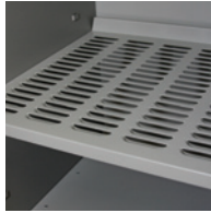
Louvered Shelf For ventilation and drying – great for body armor.