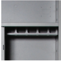
Adjustable Shelf with Integral Garment Hanger Provides clothing separation for better drying.