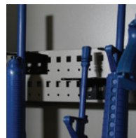
Support Rail Use with Spacesaver weapons storage components or other specialty storage accessories.