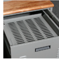
Ventilation Rack Sliding rack that sits in bench drawer for ventilation.