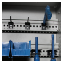
EZ Rail™ Element Innovative engineering offers flexible storage of hanging bins, slat wall accessories and weapons storage components.