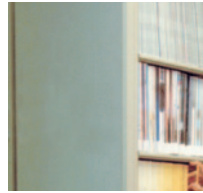
WOOD PANEL SPACER:

Self-edged banding is ideal for a more traditional look. The edge banding matches the face panel finish whether wood or laminate.