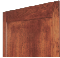
RADIUS WOOD OR LAMINATE