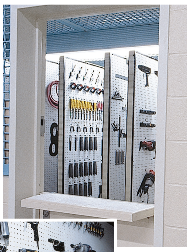
An art rack system stores all inmate manufacturing tools in a secure area.

Pegboards with tool silhouettes ensure accountability for every item.