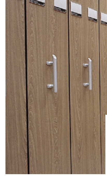
Spacesaver carriage locks helped to satisfy the mandatory three-lock requirement.

Spacesaver Corporation 1450 Janesville Avenue Fort Atkinson, WI 53538-2798 1-800-492-3434 www.spacesaver.com