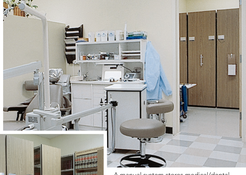
A manual system stores medical/dental records efficiently.