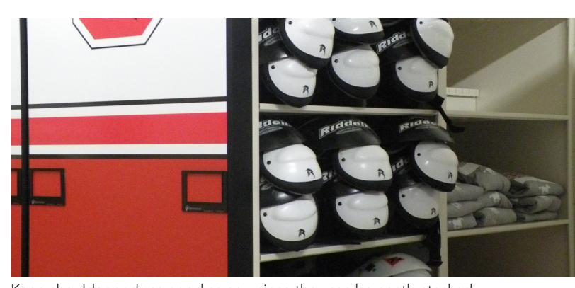
Keep shoulder pads as good as new since they can be neatly stacked in cubbies designed for the purpose.

and other garments are as fresh (and reusable) as the day they were washed and put away. Equipment managers say they greatly appreciate the system's modularity so they can easily and quickly switch out components from one system to another and/or shrink and expand it in the future, helping to further conserve funds. All that, plus team spirit thanks to a custom finish on the storage system that proudly displays the school colors and its bold Mustang emblem.