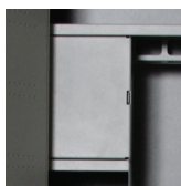
Lockable Box Kit Use this kit and add a lock to store hand guns and other valuables.