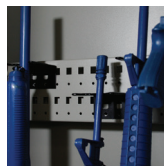
Support Rail Use with Spacesaver weapons storage components or other specialty storage accessories.