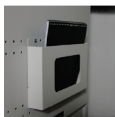
Document Holder Door-mounting allows easy access to documents and notebooks.

Unique design allows infinite custom configurations and adjustments. Many options are available, including magnetic mirrors, boot trays, and standard peg board designed doors.