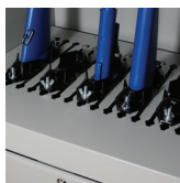
Universal Base Use in conjunction with the EZ Rail or support rail, and with Spacesaver weapons storage components.