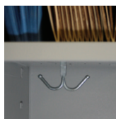
Hook Kits Add single hooks to the side of the modular shelf or a double-hook to the bottom for more hanging storage.