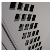
Visibility/Circulation Diamond perforated doors offer visibility as well as natural air circulation and ventilation.