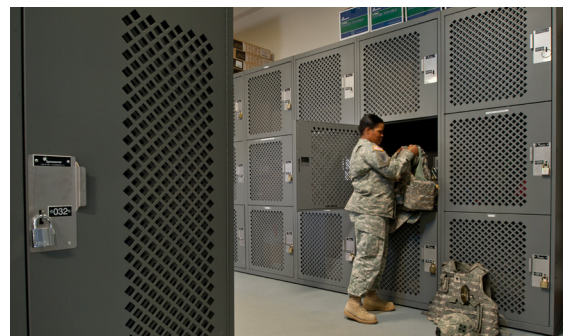
Model Shown is 30" Wide, 30" Deep, 94" High - Three Tier Mesh Door