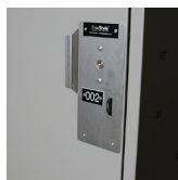
Lock Options Lock options include hasp only for pad lock, keyed lock, combination lock, or electronic lock.