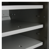
Adjustable Shelf Available in standard and heavy duty configurations for storing everything from clothing to ammunition.