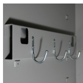
3-Hook Bracket Hook bracket can be moved up and down, and from one side of the locker to another.