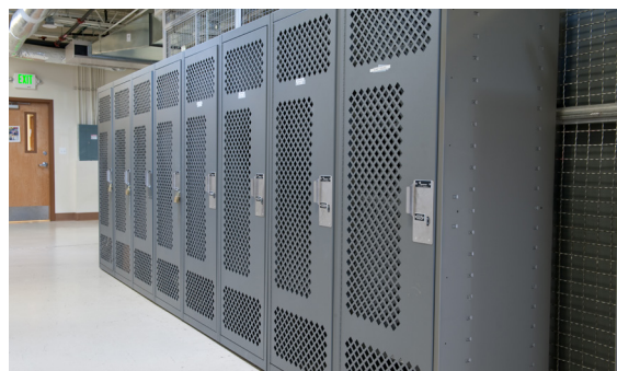
Model Shown is 24" Wide, 24" Deep, 72" High - Mesh Door

CONTACT SPACESAVER TODAY FOR A FREE SPACE ANALYSIS AND QUOTE