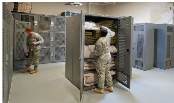
Model Shown is 48" Wide, 24" Deep, 78" High - Mesh Door