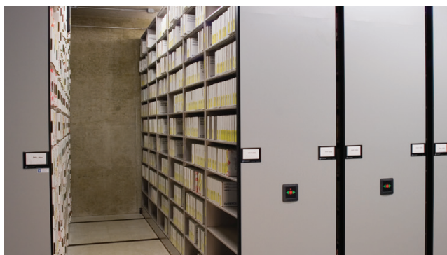
High-Density Mobile Storage (HDMS) Systems Once evidence is logged, Spacesaver HDMS Systems help maintain its integrity indefinitely.

Our Evidence Lockers have been redesigned with a new, highly secure locking system and flush-mounted handle.