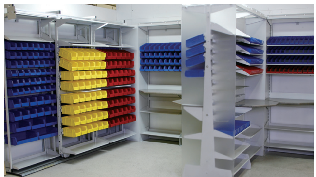
FrameWRX® Storage Systems Hang bins, trays and pegs on our modular FrameWRX Storage System's innovative rail system to maximize storage of a wide variety of evidence-processing supplies. With the flexibility to adapt to changing needs quickly and easily, FrameWRX Storage System provides highly customizable storage.