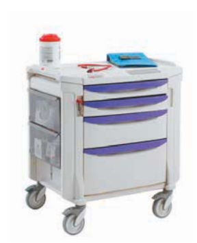
Med/Surge Package FLMDSRG