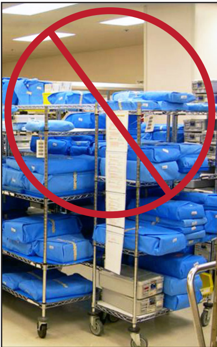
NO MORE SEARCHING!

Rotomat® Storage Carousels are fully enclosed, allowing storage floor to ceiling that is secure and protected. Automation and inventory management ensure that proper inventory levels are maintained and that items do not expire. Carousel shelves are customized to suit individual needs, avoiding stacking and ensuring ideal storage conditions.